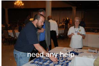
need any help