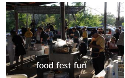
food fest fun