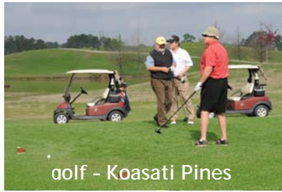
golf - Koasati Pines