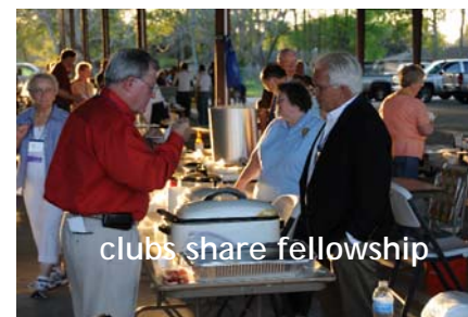
clubs share fellowship