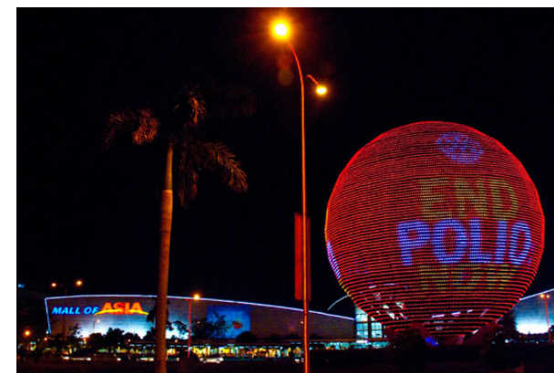
The Globe of the SM Mall of Asia in Manila, Philippines