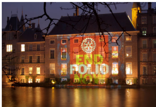
The Parliament Building in The Hague